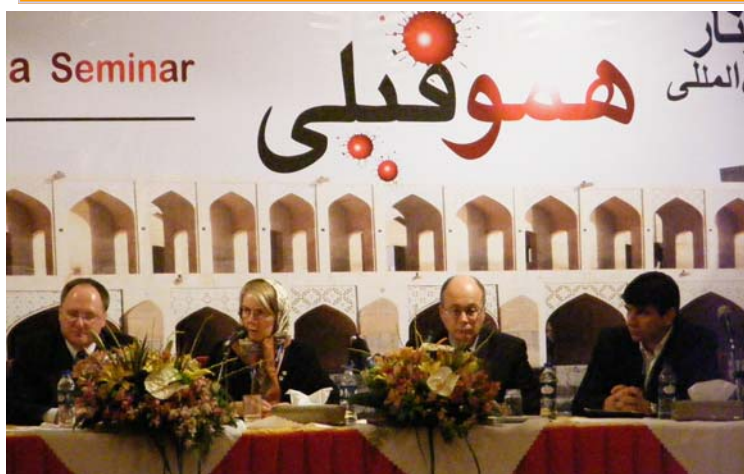
Presenting scientific and educational programs in collaboration with the WFH for specialists working with hemophilia