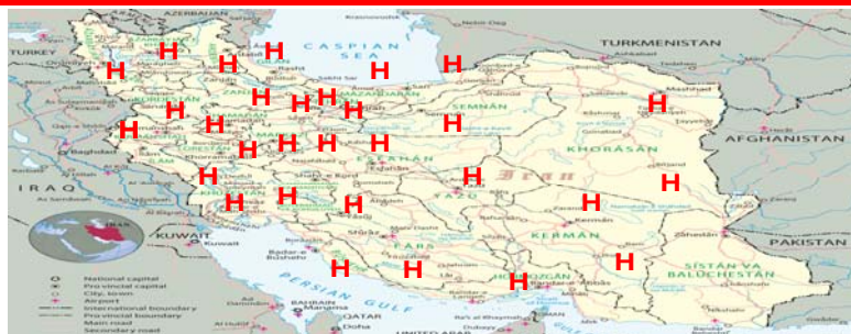
Developing and establishing 28 representative offices throughout Iran.