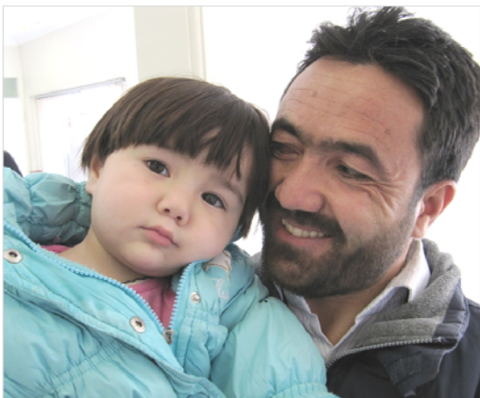
Medical and social support of Afghan and Iraqi refugees suffering from hemophilia